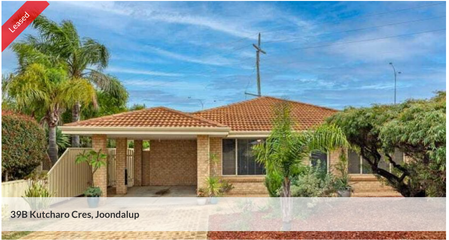
39B Kutcharo Cres, Joondalup