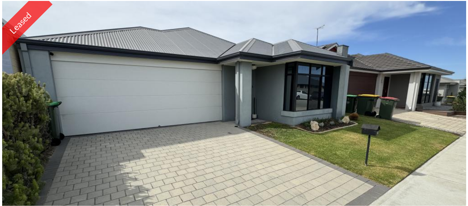
16 Alizarin Loop, Eglinton