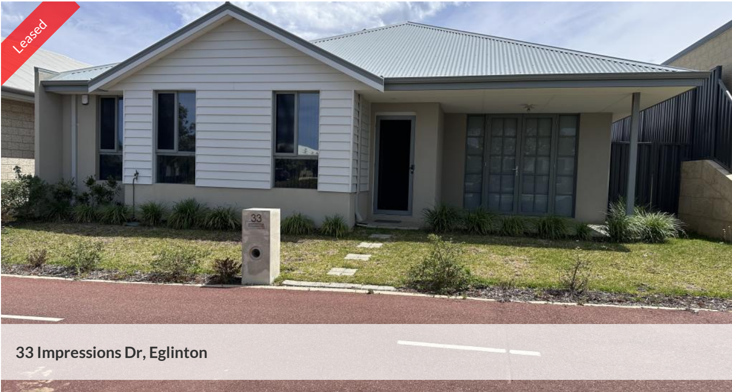
33 Impressions Dr, Eglinton