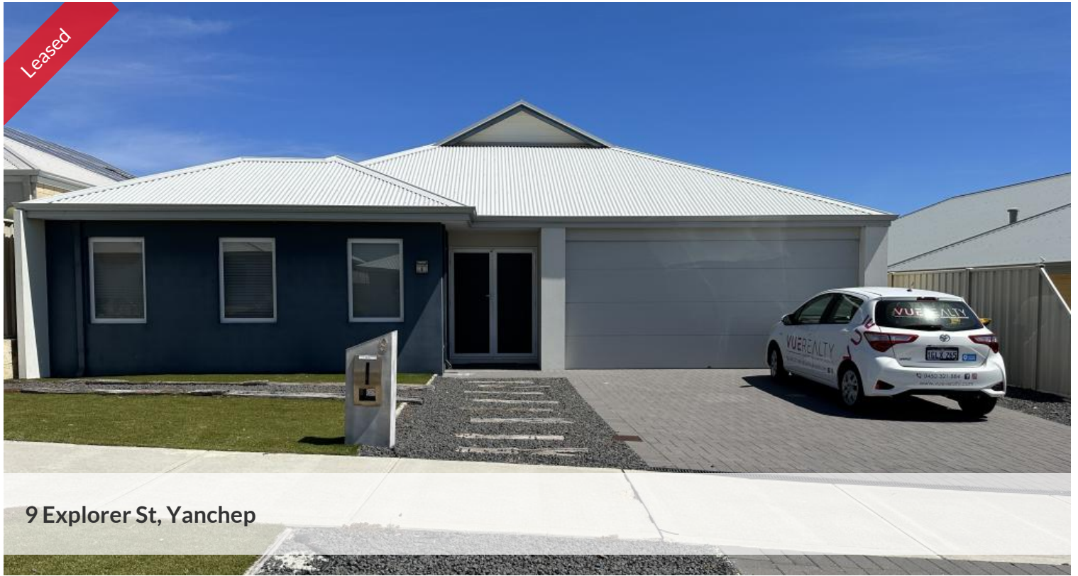
9 Explorer St, Yanchep